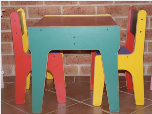
Table & Chairs