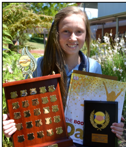
Most Outstanding Citizen